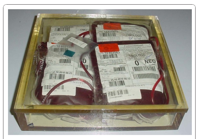
Figure 1 box filled with blood bags.

The CT scan of the box filled with four blood bags was performed for a treatment planning study. A Pinnacle 8.0 m Treatment Planning system, i.e. TPS, (Philips Medical Systems, Madison, WI) was used to calculate the three-dimensional dose distribution of bags. The prescribed dose was at least 25 Gy avoiding hot spots over 45 Gy. The calculated total Monitor Units were 922 with a rate of 600 Monitor Units/min, resulting in a dose-rate of 19.5 Gy/min.