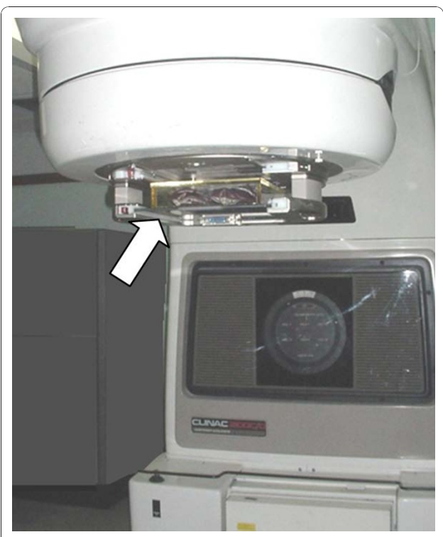
Figure 2 Box fixed at the head of the LINAC (see arrow).

The blood bags were delineated on the CT images, the dose distribution of a 6 MV photon beam (gantry 0°)