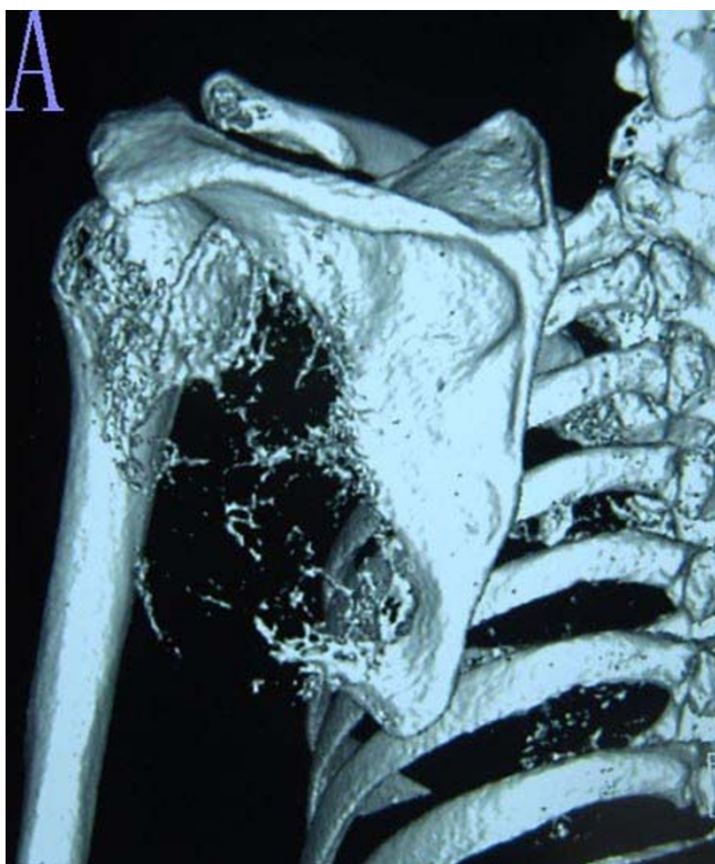
Figure 6 Radiographs and photograph of the patient with myeloma (#3). The plain radiograph shows an expansive lesion in the glenoid, neck, and border of the scapula.

rence and pulmonary metastasis [17]. Since patient #6 presented with the same features and potential damage as a malignant scapular tumor, we elected to treat this patient with wide resection.