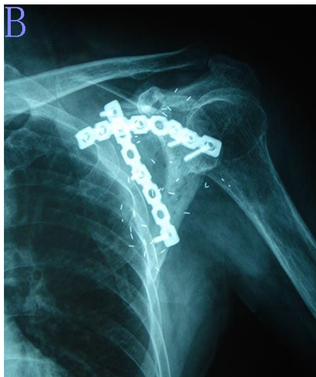
Figure 7 The plain radiography 20 months after the procedure shows the scapular allograft reconstruction. The local I 125 radiotherapy placed around scapular muscles is shown. The union of the scapular allograft is apparent and there is no dislocation of the shoulder joint.

The initial incision was considered a key factor in obtaining an adequate surgical margin and optimal reconstruction. The incision site and subsequent course was determined with several important goals in mind. One was to expose the bony and muscular elements of the