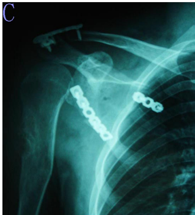
Figure 3 The postoperative plain radiograph shows the scapular allograft reconstruction.

The glenoid-saved reconstruction showed a mean ISOLS score of 24.5 points (81%), compared with 24 points (79%) in the glenoid-resected group of patients; however, the glenoid-saved patients had superior abduction/flexion motion than the glenoid-resected patients (mean, 72°/61° versus 55°/43°). Further, higher scores for emotional acceptance were recorded in the glenoid-saved allograft group than in the glenoid-resected patients. No correla-