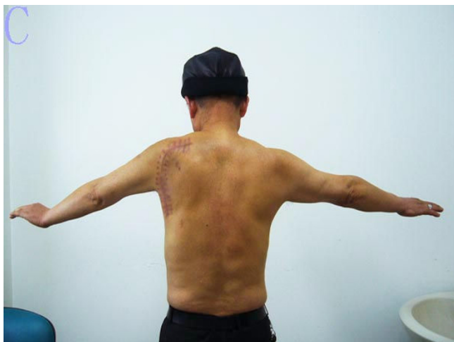
Figure 8 The acceptable active abduction function and the cosmetic appearance of the left shoulder is shown 20 months postoperatively.

sion could contribute to an unacceptable scar and the patient's negative emotional response to the surgical outcome. Nonetheless, achieving a safe surgical margin must take priority over cosmetics in these cases.