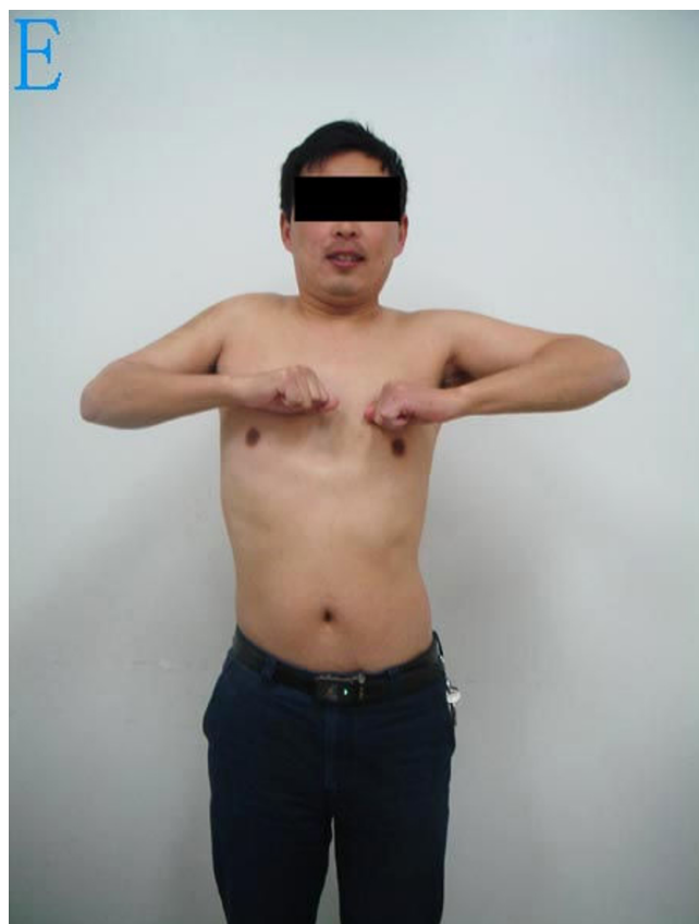
Figure 5 The shoulder abduction function and appearance 14 months postoperatively.

The surgical classification system and systemic adjuvant therapy both assist in defining safe resection borders and guiding muscle reconstruction. Type A resections (abductors preserved) and Type I-III resections of the shoulder