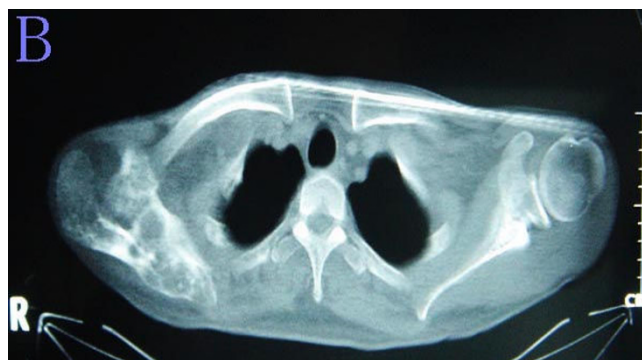
Figure 2 Computed tomography scan shows the scapular lesion expanding into the surrounding muscles.

Following excision of affected soft tissues, resection of the acromion base and coracoid process (with preservation of the tips) was performed in all patients. Subsequently, the distal end of the clavicle was resected in patient #2 and the normal glenoid (in patients #2, 3, 6, and 7) was osteomized longitudinally at least 1 cm medial to the glenoid edge in sequence while preserving the glenoid artic-