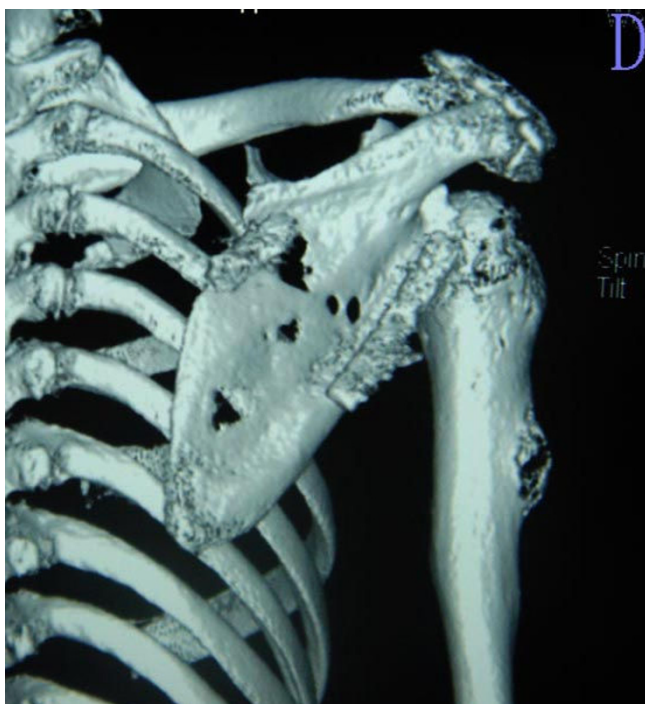
Figure 4 A 3-D computed tomography reconstruction taken 14 months after the procedure shows satisfactory healing at the host-graft junction together with slight bone resorption. Dislocation of the shoulder joint and local recurrence is not present.

degeneration were apparent as determined by radiography (Figure 6, Figure 7, Figure 8).