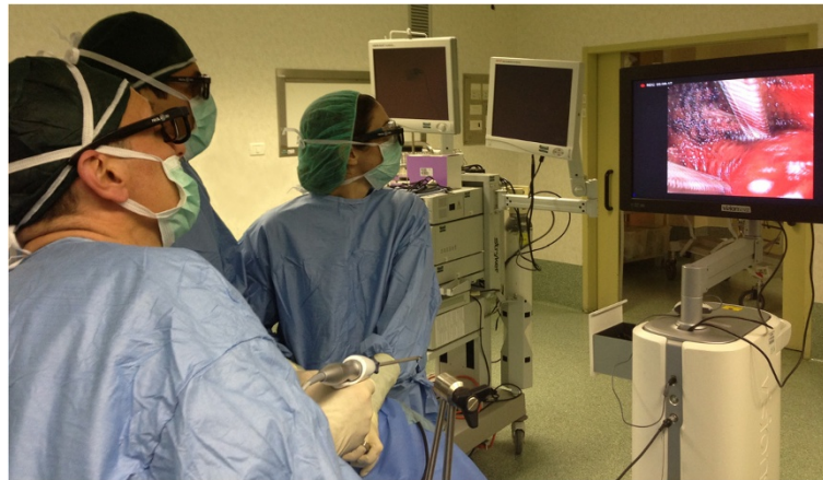
Figure 1 Minimally invasive video-assisted thyroidectomy. A view of the setting (endoscope, video camera and glasses) used for the 3D-MIVAT.

findings, technical aspects, operative time, rate of conversion into conventional technique and complications. The degree of difficulty of the 3D MIVAT technique was graded by the surgeon using a 5-point subjective scale, ranging from 5 (very easy) to 1 (very difficult) in order to recognize the upper and lower vascular pedicles, the parathyroids, the superior and inferior laryngeal nerves. Patients were asked to report their opinion according to the cosmetic results and postoperative pain. Cosmetic results were graded using a 4-point scale, ranging from 1 (very happy) to 4 (unhappy), while postoperative pain was evaluated by a visual analogue scale (VAS) from 1 (no pain ever) to 10 (worse pain).